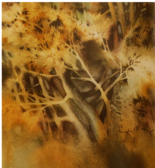
Time signature Linda Kemp Mixed water media

Soraya French loves to use really dynamic colours and has introduced gorgeous purples to this autumnal landscape. In this painting, she used acrylic paints and inks as well as oil pastels. Sometimes, she'll start with a textured surface created with gesso.