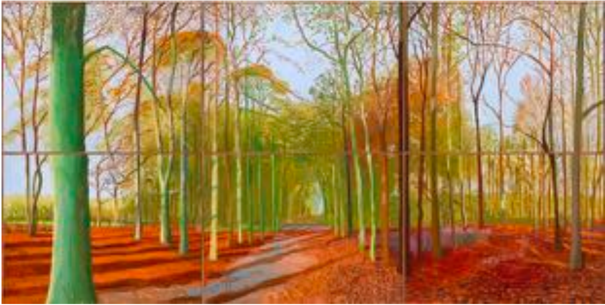
Woldgate Woods by David Hockney

This month, I suggest you choose Autumn as the subject to explore and inspire you. This might mean looking at the seasonal changes in Nature and the landscape or you could explore your feelings as we head into colder weather and more Corona virus restrictions. There's plenty of inspiration from paintings to poetry.